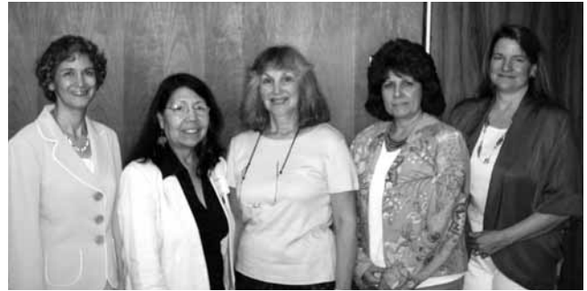
2007 Literacy Champions