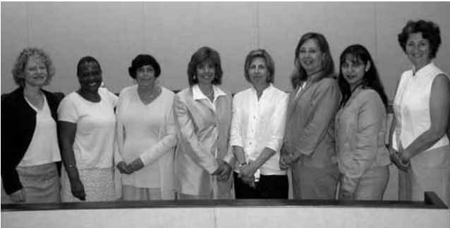
2006 Literacy Champions