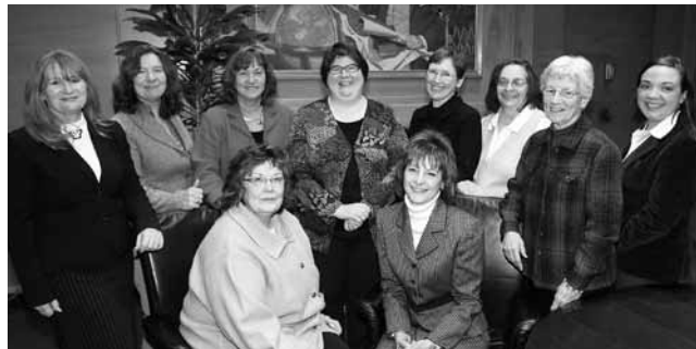
2008 Literacy Champions