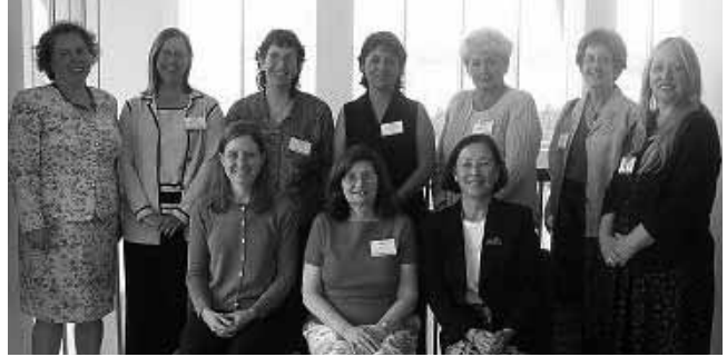
2005 Literacy Champions